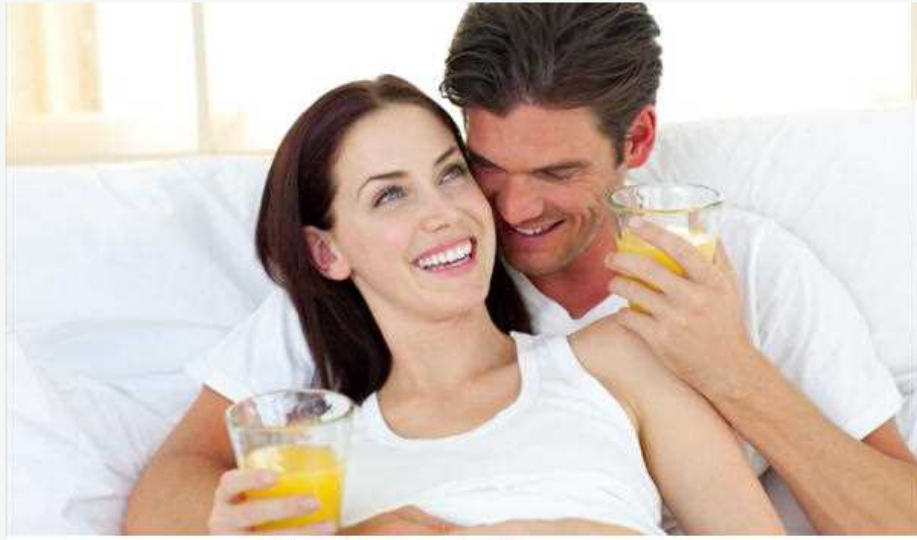
Most Potent Pheromones

A pheromone is a chemical that is normally secreted in an individual's perspiration. Experts have studied this chemical for years and have found that it can change the way couples react one to the other. Here are some ways that these chemicals can help you put that new and exciting feeling back into your relationship.