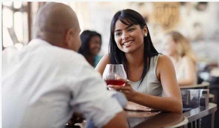
PheromonesChemical CompoundsDating Scene