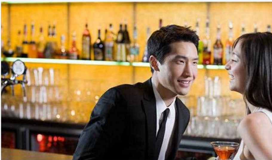
PheromonesHuman PheromonesVomeronasal OrganSexual AttractionSeduction

You would like to learn the signal of sexual hormone balance and attraction, and also the art of seducing beautiful women, then check out my web site and get your hands on my free report that has changed the dating life of thousands of men and turned them into dating kings.