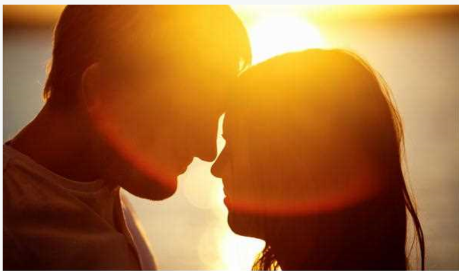
PheromonesHuman PheromonesHuman BodyPheromone ProductsAndrostenonePheromone

The more expensive the product or perhaps the more pheromones inside it, the better it is. This statement happens to be a complete lie. In fact, the best pheromone product that works for me is NPA or new pheromone component. This product comes in a smaller bottle which is cheaper than most pheromone items. It also just has one pheromone substance which is Androstenone . Yet this product is loaded with lots of great reviews and hype all over the pheromone community.