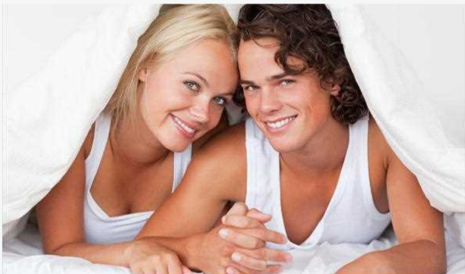
PheromonesNexus PheromonesPheromones ReviewNexus Pheromones